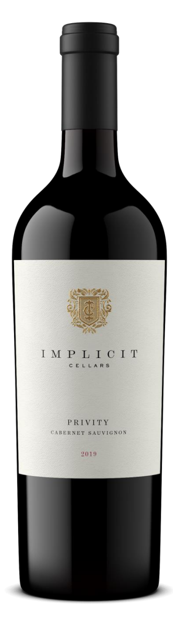
202 Cases Produced Alcohol % 15.4 Harvest Date 10/1/2019 Bottling Date 5/24/2021 100% New French Oak: Taransaud, Demptos, La Grange & Nadalié

Winemaker Notes: The IMPLICIT CELLARS 2019 PRIVITY displays a deep purple-red color with a black core. Fresh aromatics of blueberries, blackberry pie, crushed rock, anise, coffee-laden mineral accents, vanilla and a lifting waft of sage fill the glass. On the palate, the layered, rich essence of the wine is on full display, with deeply powerful cherry, chocolate, and exotic spice notes in full concert. The finish is long and supple, with abundant very fine tannins providing shape and length without ever getting in the way of the purity of fruit. ~ Michael Hirby